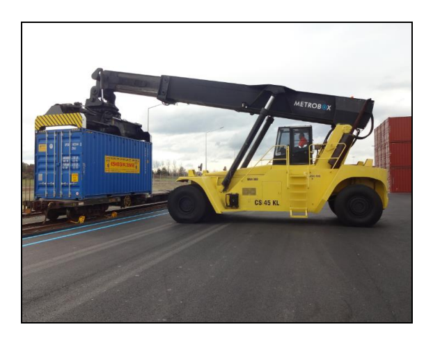
A top lifter can weigh up to 100 tonnes - these machines cannot stop quickly!